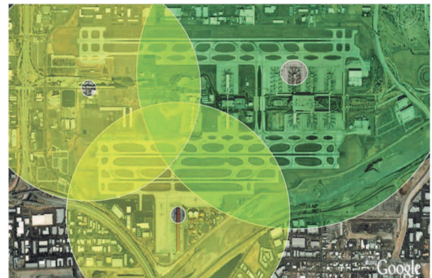
The above photos show 3 Spynel-C cameras which can be more effective than 56 narrow field of view PTZ cameras.