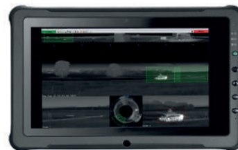
Rugged tablet with CYCLOPE Software

With this innovative Kit, the soldiers directly receive alerts on their rugged tablet via a wireless link. It allows them to be mobile and to be assigned to other functions in parallel. Another strong point is the low bandwidth, which allows access to the camera from one or several remote control centers.