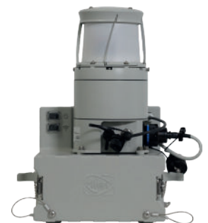
Mobile Deployment Kit