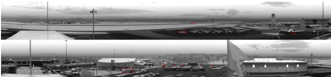
2 panoramic views of the airport including tarmac & parking.

According to the layout of the airport, several studies were provided to the authorities to determine the best surveillance configuration. Two SPYNEL-U uncooled thermal cameras were installed at strategic locations to provide a full coverage of the multiple critical areas to secure with no dead zones . The fully integrated dual panoramic views of the SPYNEL-U enable the operator to take advantage of both the long-distance automatic detection and tracking thanks to the thermal panorama as well as an enhanced identification of all threats and suspicious objects thanks to the high resolution and contrast of the visible panorama .