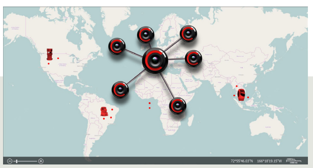
→ Multi-site operation