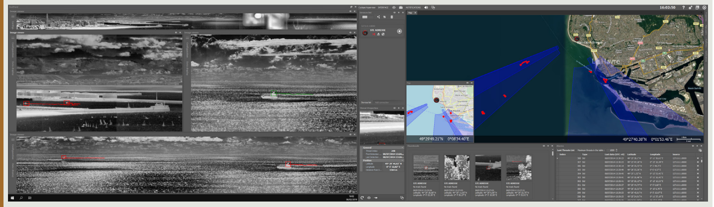
→ Geolocation of all threats and sensors on map - Thermal video display (panoramic, zooms, thumbnails of intruders)