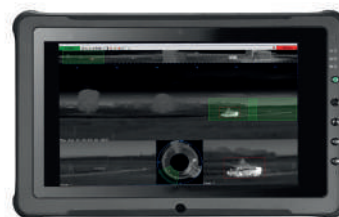
Rugged tablet with CYCLOPE Software (Mobile Deployment Kit)