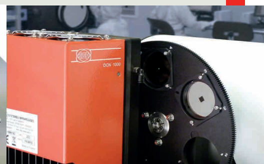
→ DCN1000 - collimator reference source