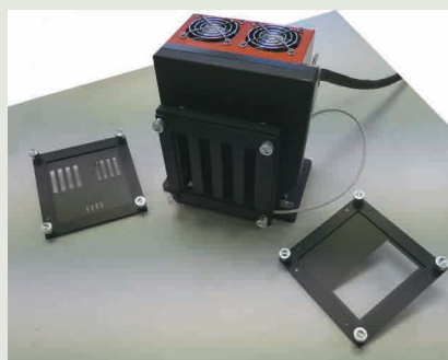
→ DCN1000 H4 and targets