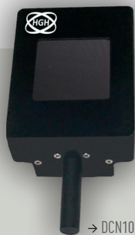
→ DCN1000 W2