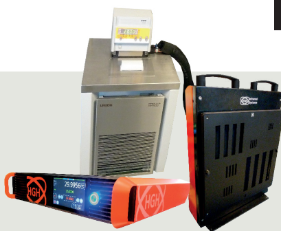
→ DCN1000L12, cooling unit &amp; MRTD target