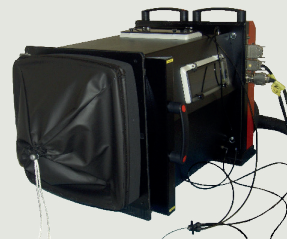
→ DCN1000 L12 and anti condensation frost system