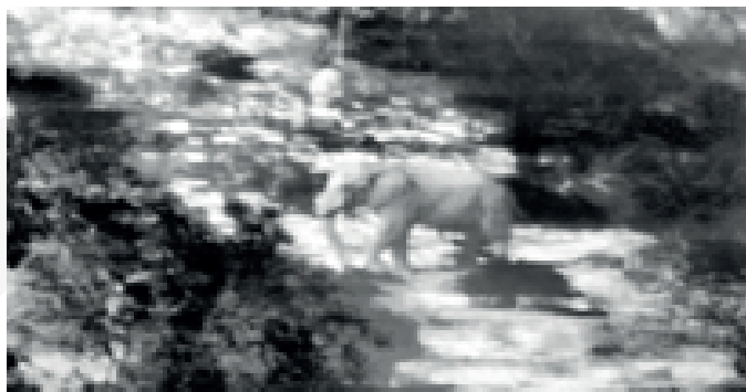
Thermal image of an elephant

The CYCLOPE software relies on powerful algorithms perfected to minimize false alarms due to dust clouds or vegetation blown by wind . The high thermal sensitivity allows for detection of the smallest threats at a great distance. No event is missed: people walking slowly or crawling, even when camouflaged.