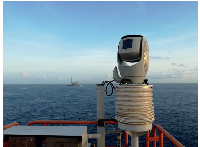
Spynel sensor onboard