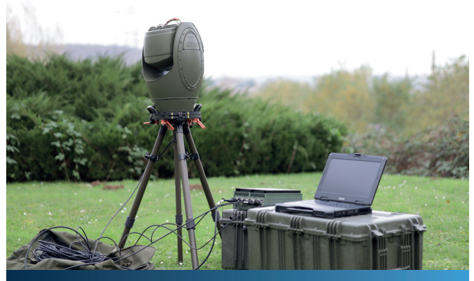
Spynel-X solution deployed on tripod

Without any operational Air Defense systems, the aerial warfare can start, endangering the civilian population and troupes.