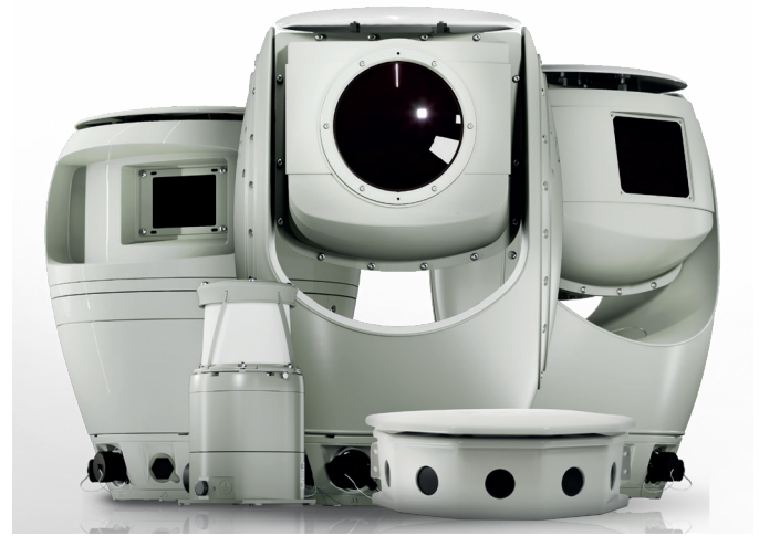
Spynel 360° IR passive sensors

The 360° thermal imaging surveillance and video analytics capabilities provided by HGH SPYNEL sensors powered by CYCLOPE intrusion detection software will help the naval base to better address its security challenges.