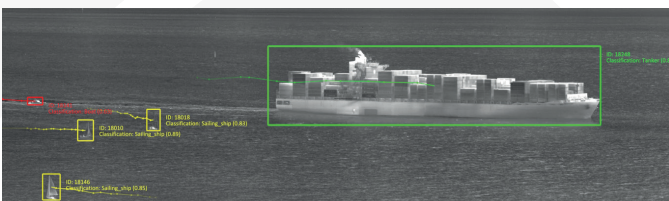
Cyclope video analytics for maritime surveillance

According to our customers "SPYNEL solution ensures a powerful 24/7, day&night protection of the base against malicious acts thanks to the most comprehensive real-time situational awareness over 360°. The ability of Cyclope software to identify and classify threats through Artificial Intelligence (AI) has been a key selection criterion.