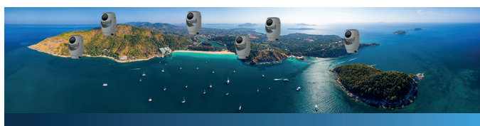
Maritime security of an island with Spynel sensors

SPYNEL sensors use the latest thermal imaging technologies providing unparalleled high resolution 360° videos, motorized tilt of spinning head and Artificial Intelligence. Unlike radar, the real-time visual information facilitates the understanding of the situation whilst the passive technology makes it undetectable by neighboring countries. SPYNEL sensors also enable reliable detection, tracking and classification of small and fast moving targets as well as low air targets, which are typical limitations of radar.